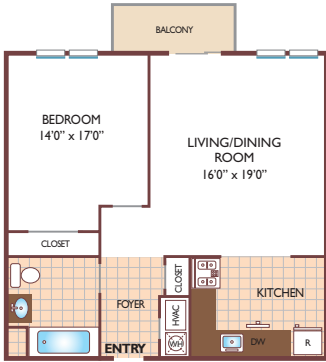
One Bedroom Floor Plan Model 1A with 1 Bath, 1000 sq. ft.