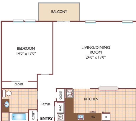
One Bedroom Floor Plan Model 1C with 1 Bath, 1142 sq. ft.