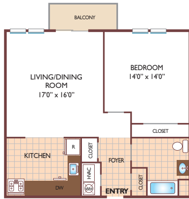
One Bedroom Floor Plan Model 2B with 1 Bath, 850 sq. ft.