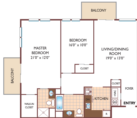
Two Bedroom Floor Plan Model 2E with 2 Baths, 1105 sq. ft.