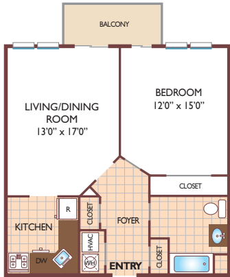
One Bedroom Floor Plan Model 2A with 1 Bath, 750 sq. ft.