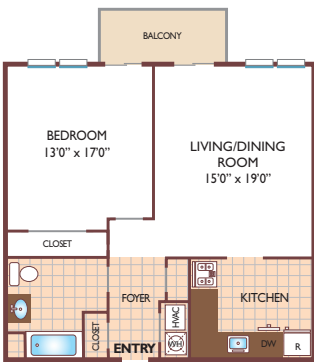
One Bedroom Floor Plan Model 1B with 1 Bath, 860 sq. ft.