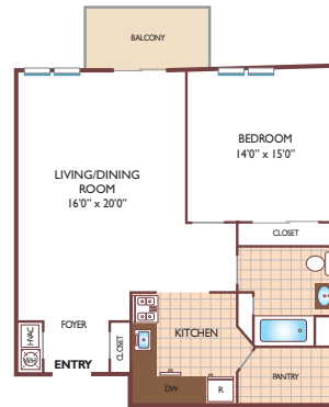
One Bedroom Floor Plan Model 1D with 1 Bath, 970 sq. ft.