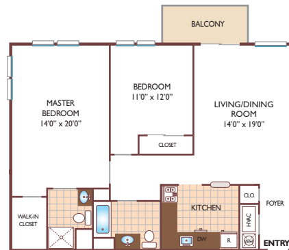
Two Bedroom Floor Plan Model 1E with 2 Baths, FGFI sq. ft.