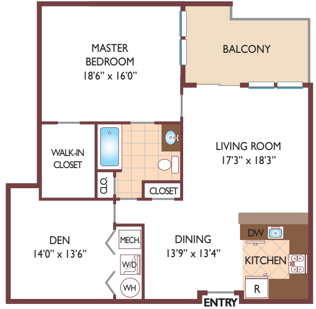
One Bedroom w/ Den Floor Plan with 1 Bath, 1270 sq. ft.