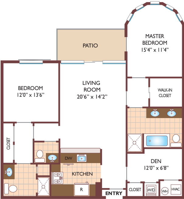
Two Bedroom Floor Plan A with 2 & 1/2 Baths, 1536 sq. ft.